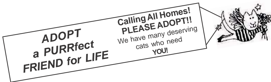
Cammie Bio # 2578 JI

Make a Difference in Your Community ... Trap-Neuter-Return (TNR) Works!