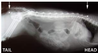
X-rays reveal BBs lodged in Mia's back, evidence of the abuse she faced outside.

In September 2007, we took Mia to the vet to treat mysterious vomiting. It was nothing serious, but we had her X-rayed to be certain. When the film came back,