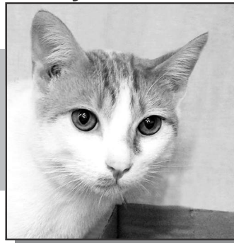
Lenny Bio # 2603 TR

People dumped me, two friends, and some kittens under a freeway overpass. Would it have been so hard to put us in a nice place where people care?