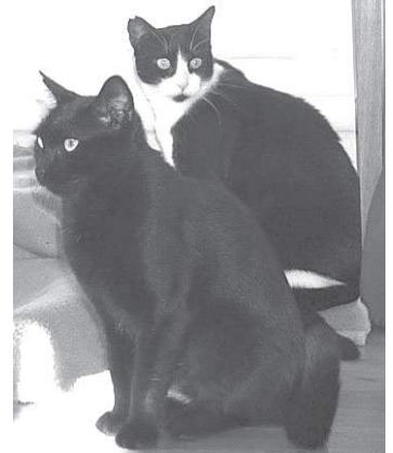
Gracie (Bio # 2993B GC) & Boushey (Bio # 2593A GC) are looking for a quiet and patient home to fill with love.

I drove her home to an organized, comfortable, and clean environment with plentiful and nutritious food. Within three days, Gracie gave birth to five tiny black kittens. Youth aside, she was a good and attentive mother. And so the weeks passed. Back at the colony, Boushey languished – he ate less, lost weight, and looked ragged. When I whistled it seemed as though he came running more for