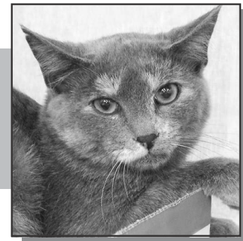
Zen Bio # 2486A JI

My brothers and I had to watch our mom get hit and killed by a car. We were six weeks old and all alone until someone found us huddling in the rocks nearby.