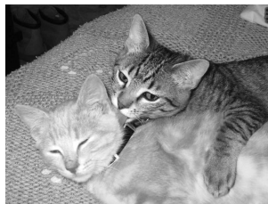
Winston, being groomed by Franklin, will be missed by his human and cat companions.