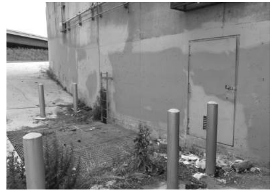
the access door to the storm drain area