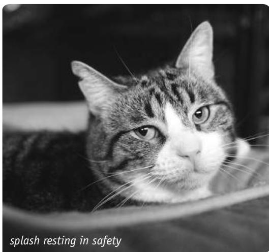
splash resting in safety