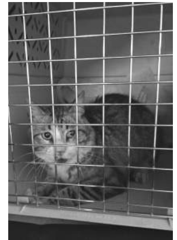
finally out of harm's way