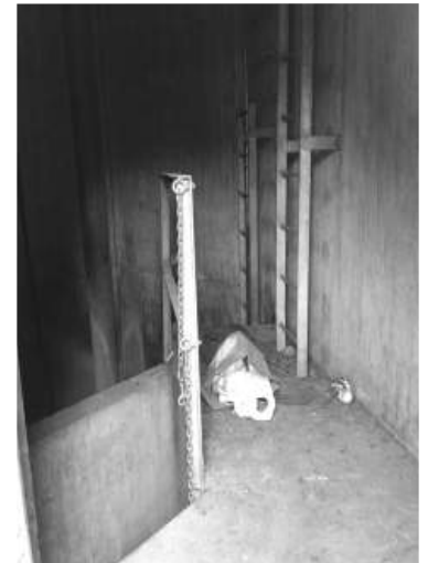
ladders inside the storm drain area