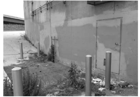
the access door to the storm drain area