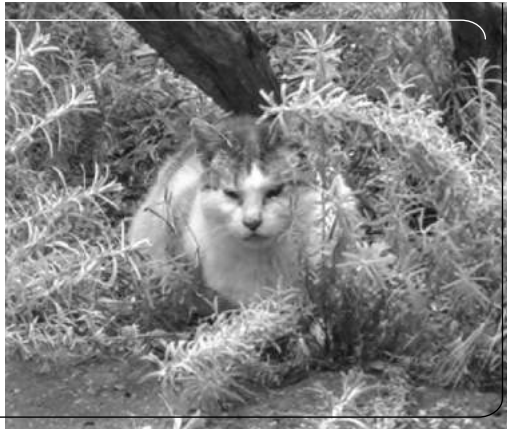
AFTER: recovering peacefully with assistance and food