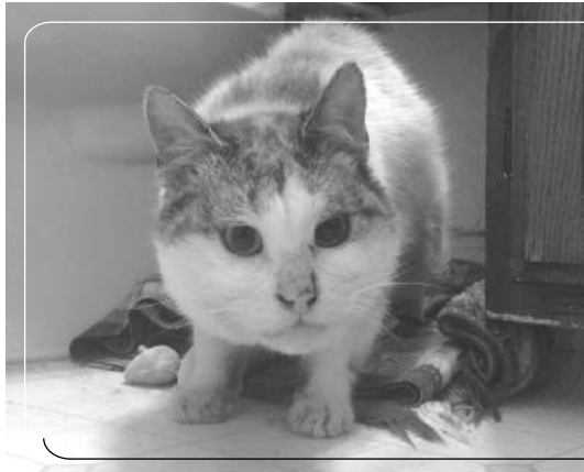
BEFORE: struggling and suffering with parasites

On Becoming a Serendipitous Garden Cat Guardian