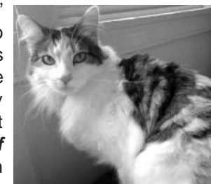
Hillary Kitten, ICRA spokesperson turned stay-at-home kitty, was adopted in Feb 2009.