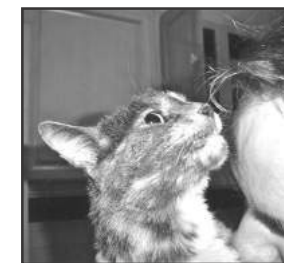
Mattie (f. Martha)