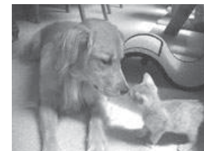
Rosie knows what kittens are capable of ... do you???

Kitten season chugs along, and those little bundles of cuteness are hard to resist. ICRA has many kittens looking for great homes, but our number one concern is making the right match. 'Rosie' Churchill was ready to tackle kitten care, but are you ready for kittenmania ??